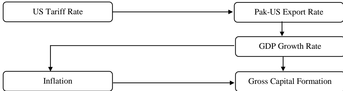
Fig. 1 Conceptual Framework